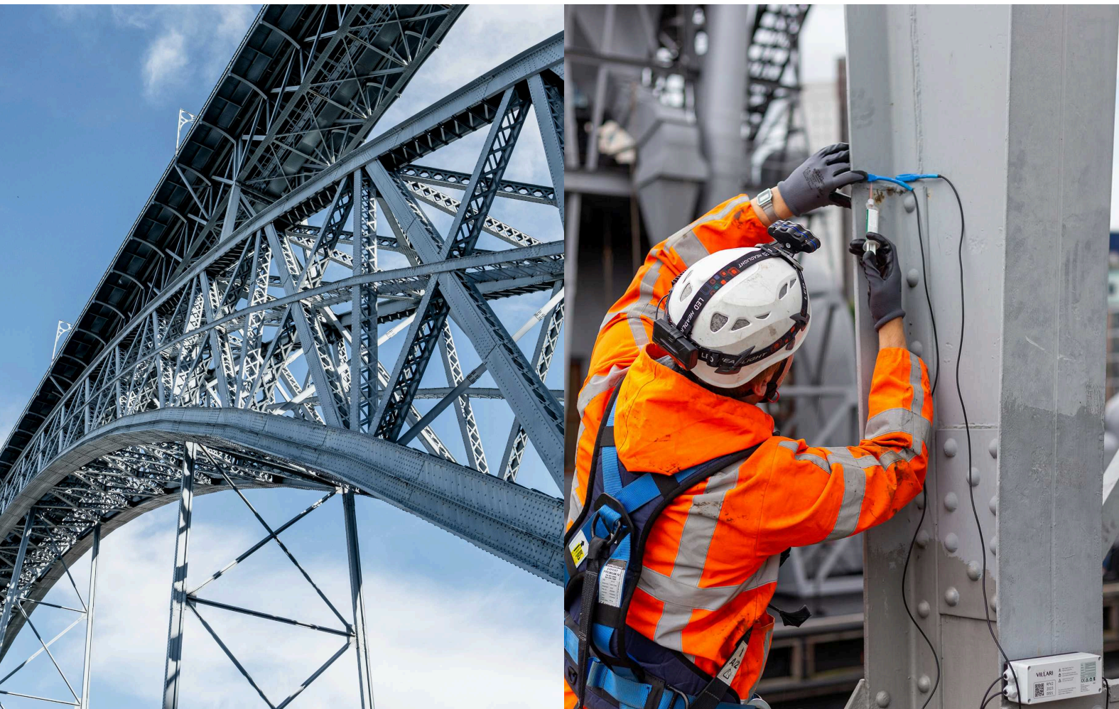
Figure 1 (Left) This image illustrates a steel bridge. (Right) Villari's crack detection sensors are typically installed at critical stress points, to ensure continuous monitoring and proactive maintenance.

To avoid unplanned downtime and expensive repairs, Villari collaborated with the bridge's owner to implement a continuous monitoring system. The sensors were strategically placed on the deformed flange, a process that required minimal installation time and no surface preparation. The sensor system detects crack growth by monitoring changes in the ferro-magnetic field of the steel structure, providing real-time data on any structural developments.